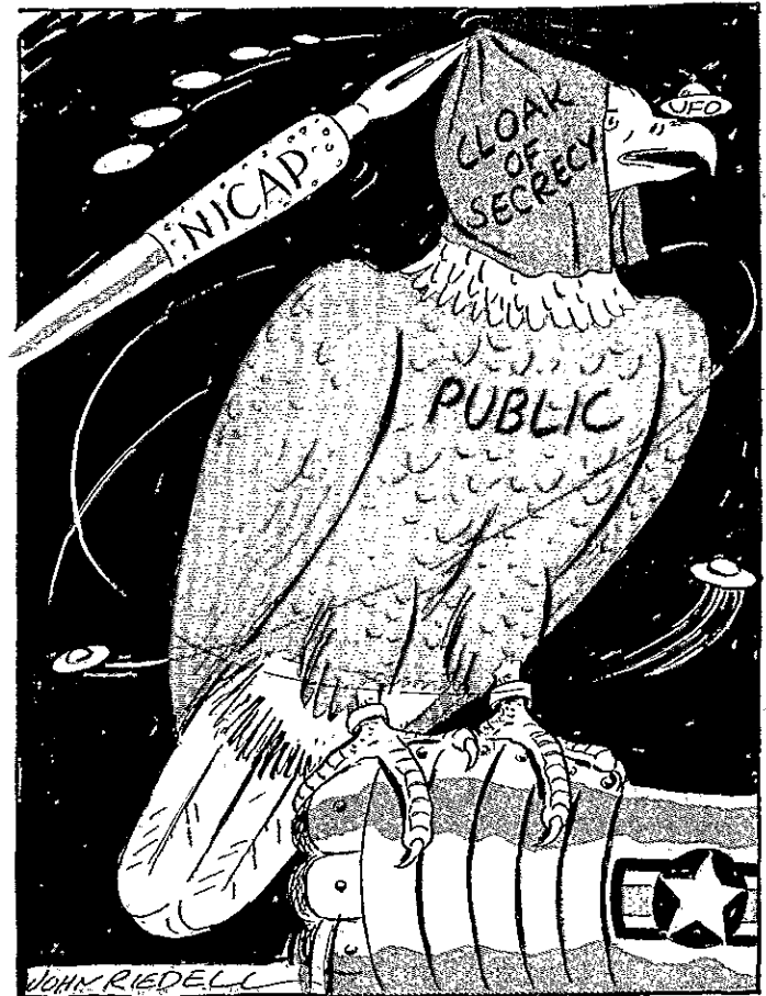
That the Blinded May See

Over 8,000 UFO sightings are on record at NICAP, including verified reports by hundreds of veteran pilots, astronomers, tower operators and other qualified observers in the U.S. and abroad. These include detailed daytime encounters with disc-shaped objects, maneuvering singly or in formations, at speeds far surpassing any known aircraft or missile operating in our atmosphere. Evaluation by NICAP has shown definite shapes, patterns and maneuvers, indicating that the unknown objects are operating under intelligent control.